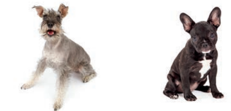
Typical breeds for size 2: Miniature Schnauzer and French Bulldog