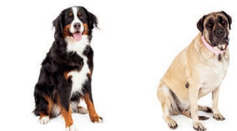
Typical breeds for size 6: Bernese Mountain Dog and English Mastiff