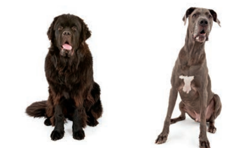
Typical breeds for size 7: Newfoundland and Great Dane