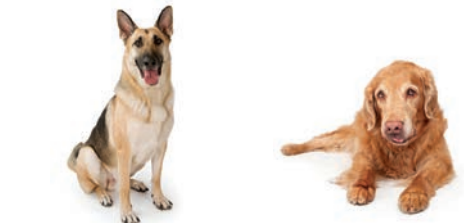
Typical breeds for size 5: German Shepherd and Labrador Retriever