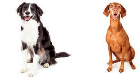
Typical breeds for size 4: Border Collie and Vizsla