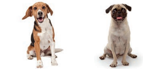
Typical breeds for size 1: Beagle and Pug

Biko Sports Bands are available in sizes 3 through 6. Sizes 1 and 2 for smaller breeds, and size 7 for Giant breeds can be made upon request at no additional costs.