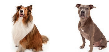
Typical breeds for size 3: Shetland Sheepdog and Pit Bull Terrier